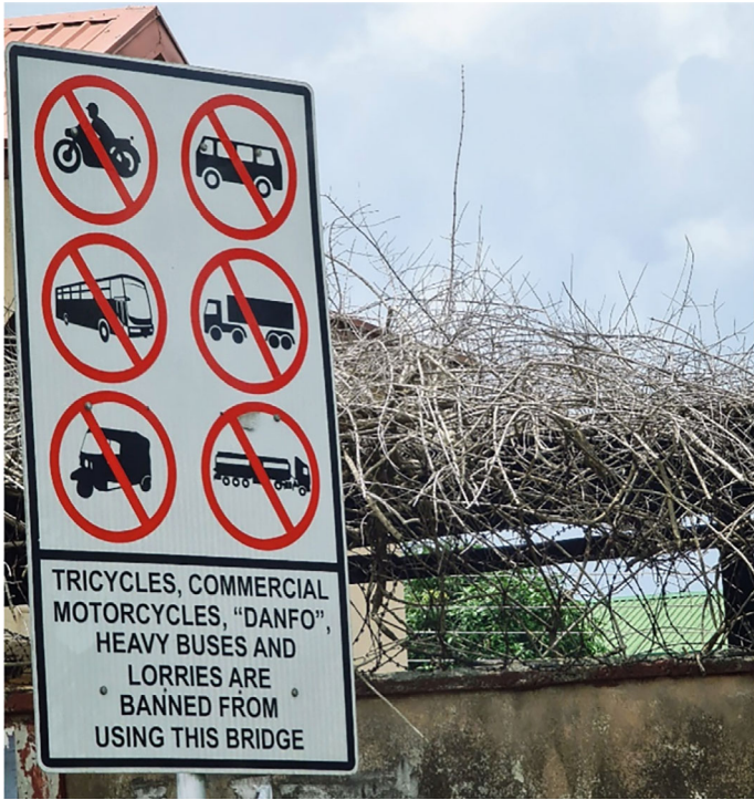
Fig. 8.1 A road sign specifying the vehicles banned on Lagos Lekki-Ikoyi Link Bridge

safety, and enforce road laws. They include: regulatory road signages; traffic control; vehicle safety checklist and checks; traffic policing and monitoring; traffic violation punishments; vehicle registration—which also enforces vehicle insurance; regular vehicle roadworthiness test; drivers’ licensing; drivers’ education on traffic laws, norms, vehicle safety checks; and public education (DRTS, 2018; FRSC, 2007, 2022). Non-compliance with traffic laws is consequential. It can result in fines, jail time, or licence revocation for those culpable. To enhance road law compliance, data and AI-driven road technologies such as smart traffic control lights, CCTV cameras, and automatic number plate recognition are increasingly being adopted for traffic management and law enforcement (Bolanle, 2023; Burt, 2022; Nwafor, 2023).